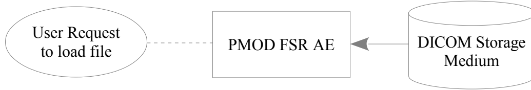
Figure 5.1-1 APPLICATION DATA FLOW DIAGRAM