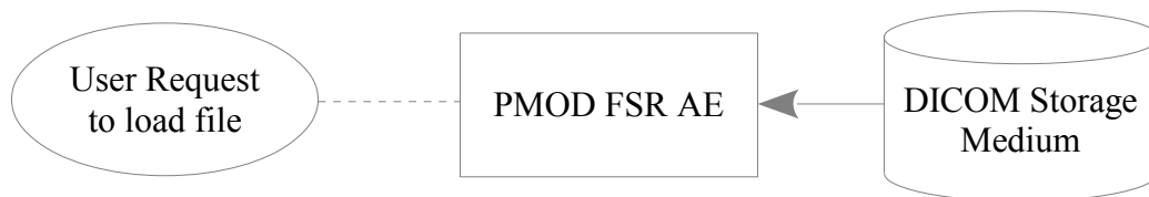
Figure 5.1-1 APPLICATION DATA FLOW DIAGRAM

For the purpose of media access whole PMOD application is treated as a single application entity (PMOD FSR AE). It provides capability to load PS3.10 compliant files, that includes DICOMDIR, images and RT structure region definitions, according to the user selection. The presence of the File Set in the selected directory will be automatically detected and DICOMDIR referenced images will be listed for selection at the series or acquisition level as selected by the user. When DICOMDIR is absent files are scanned for patient and series related information and results are displayed for selection. In the absence of PS3.10 compliant meta information header default transfer syntax is assumed (Implicit VR little endian). Files may be accessed from local file system or from PS3.12 compliant media according to one of the General Purpose Application Profiles of PS3.11 (CD-R or DVD-RAM).