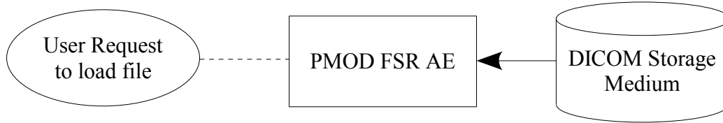
Figure 5.1-1 APPLICATION DATA FLOW DIAGRAM

transfer syntax is assumed (Implicit VR little endian). Files may be accessed from local file system or from PS3.12 compliant media according to one of the General Purpose Application Profiles of PS3.11 (CD-R or DVD-RAM).